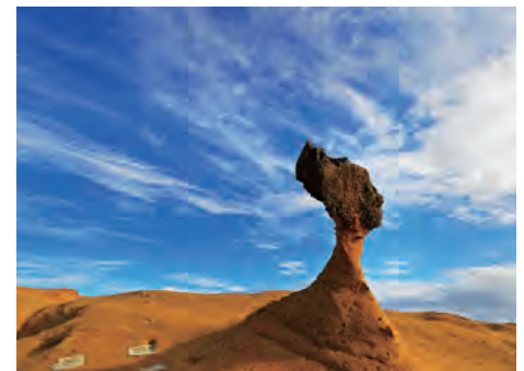
Immortals. Arrive at Hualien. (Silks Place) (B)

Begin touring the exciting East Coast National Scenic Area, stretching a little over 100 miles down the east coast. Stop at Siao-yeliou, Sansientai, Stone Steps, and Caves of the Eight